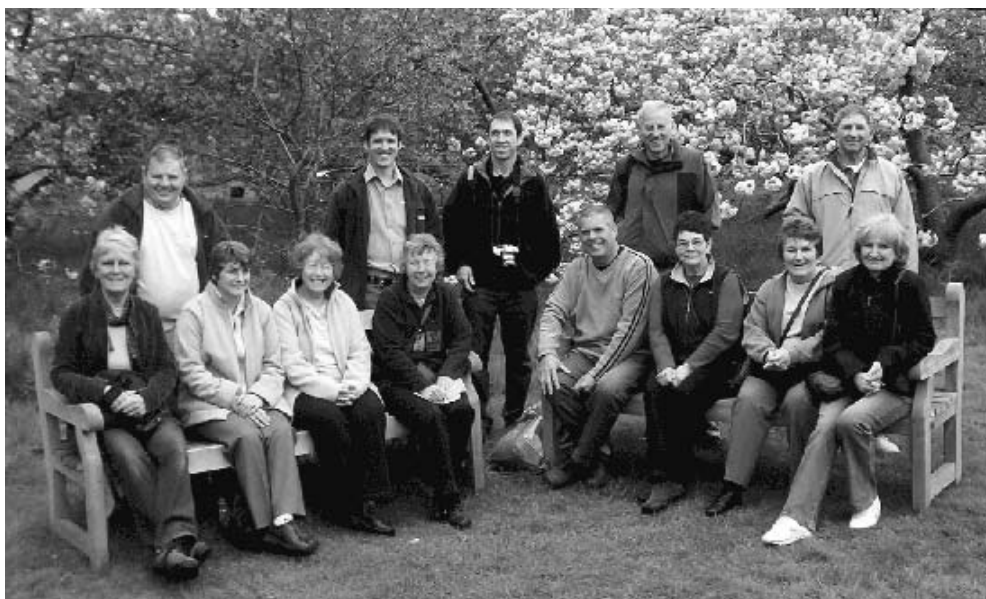
Some of the trippers enjoying a welcome rest!

A lovely day was enjoyed by all on the trip to Kew Gardens on 16th April.